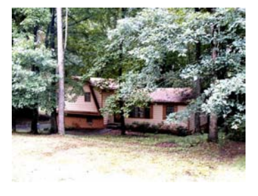
3 Bedroom, 2 Bath 1500 Sq. Ft. East Cobb