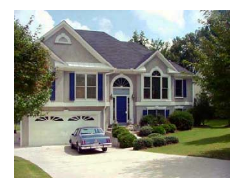
3 Bedroom 2 ½ bath 1800 Sq. Ft. Townlake