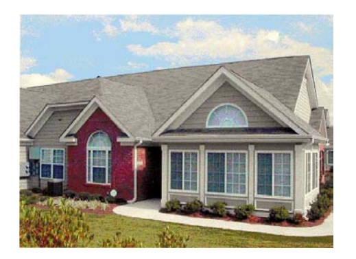
3 Bedroom, 2 Bath, 1600 Sq. Ft. Orchards of Roswell

Sure you've looked at the new homes. The builders promise a super financing deal, but you know that even if you qualify, you'll still have lots of expenses that all new