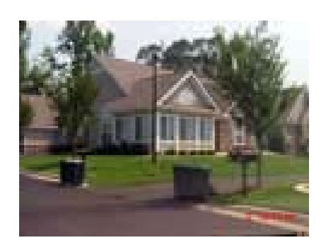
3 Bedrooms, 2 Baths, 1600 Sq. Ft. Roswell