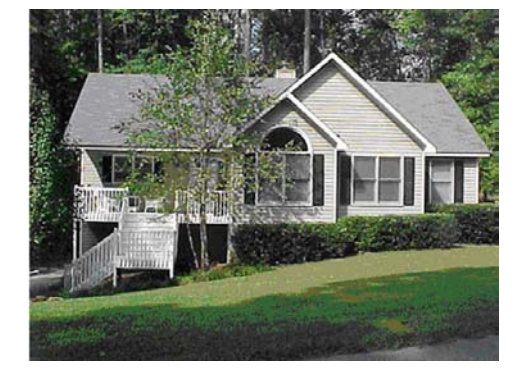
3 Bedroom 2 bath 1700 Sq. Ft. Lake Arrowhead