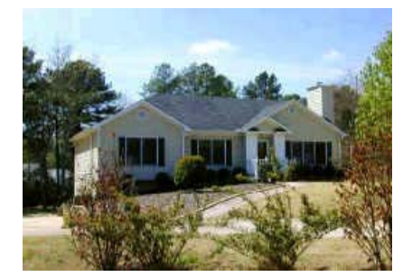
3 Bedroom, 2 ½ Bath 1700 Sq. Ft.