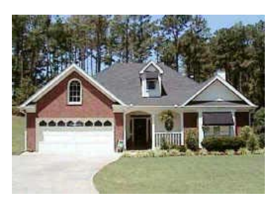
3 Bedrooms, 2 Baths 1600 Sq. Ft. Townlake

Location Size of Home Down Payment Monthly Payments Equity Buildup