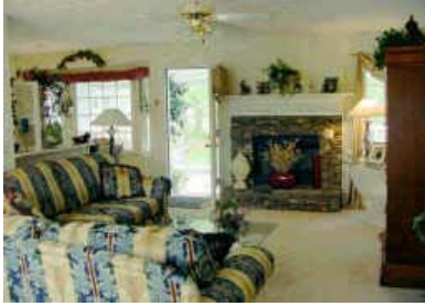
3 Bedroom, 2 Baths 1300 Sq. Ft.

Thinking about buying can quickly become wanting to buy... and it's amazing how fast "want to" can become "have to". Whatever the reason, it puts you in a pickle.